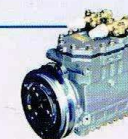
Compressor CR2318LWR (For low temperature)